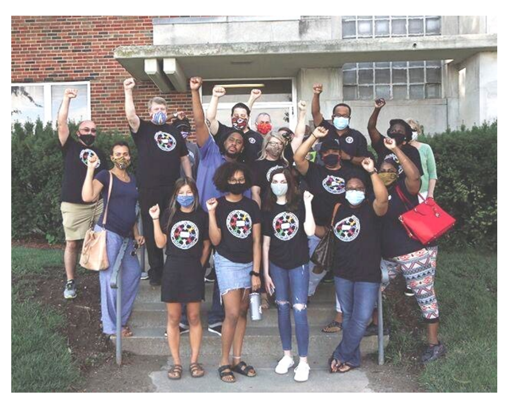
Pictured left: Members of Atchison United celebrate the street name change of Division St. to Unity St.

There is a LOT of education that needs to be happening with priests, educators